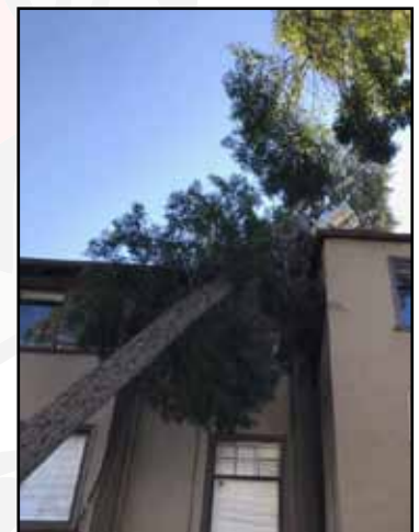
The second tree fall, this time into the house, damaging the kitchen fan motor