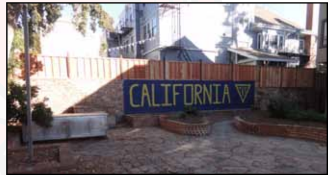
The rebuilt fence along the east property line