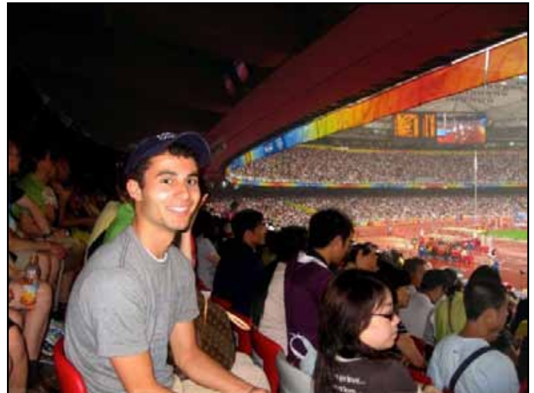
2008 Beijing Olympics