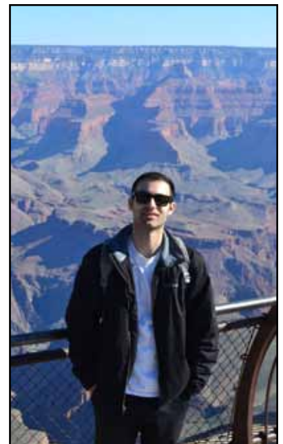
Badwater Basin - lowest point in Western Hemisphere Turkey