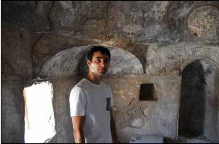
1,000 year old church in Eastern Turkey