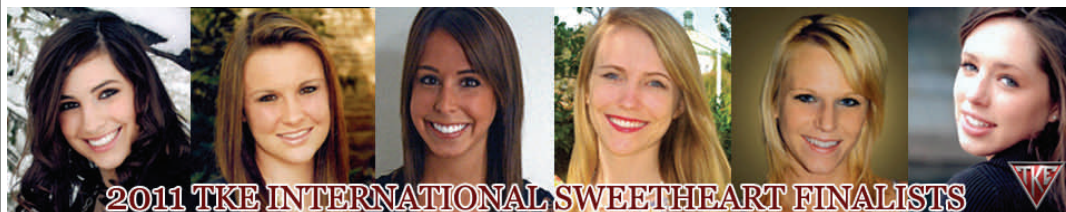
2011 TKE INTERNATIONAL SWEETHEART FINALISTS

The Sweet Six are in. Voting is available for the six finalists for the 2011 TKE International Sweetheart Scholar-