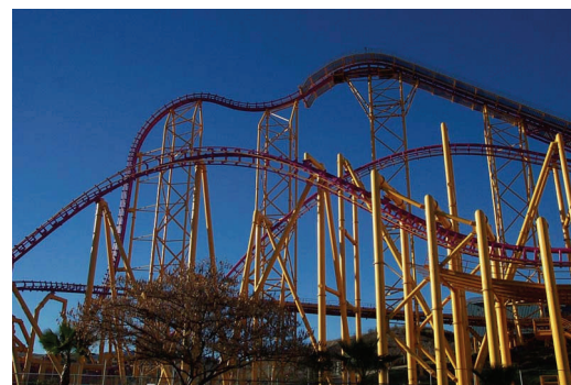
Tatsu, meaning Dragon in Japanese, the groups favorite roller coaster with seating designed to simulate flight.

cal loop, a total of five times throughout the day.