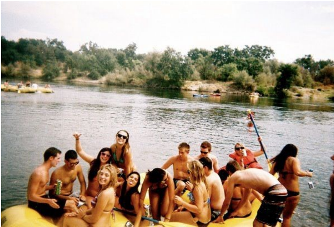
Fraters and Guests enjoying the day out on the Water