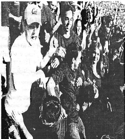
Touchdown Cal! Watch out for the TKE mosh-pit