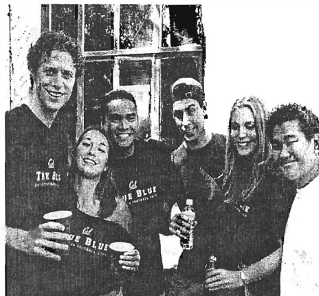
Pre-game party at the TKE house! I hope that's only coke in those cups!