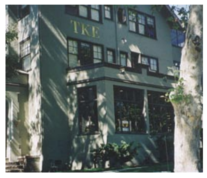
The restored Chapter House on Channing Way