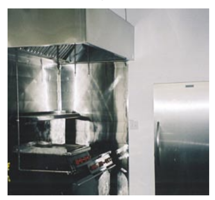
State-of-the-art appliances in the remodeled kitchen