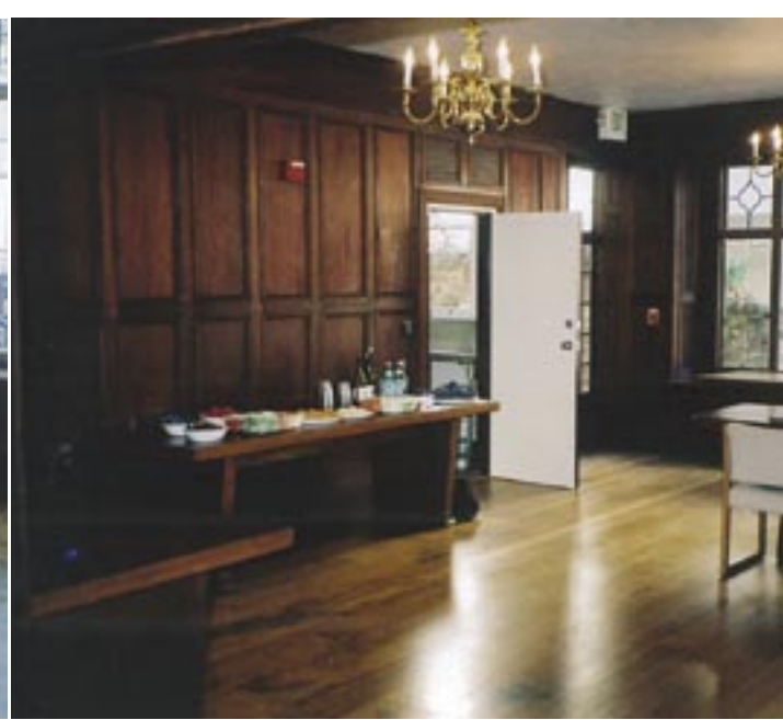
The Dining Room, refinished floor