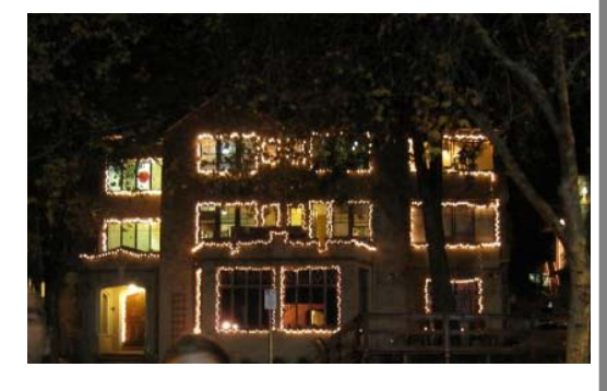
The Chapter House lit up for the Holidays!

This just goes to remind everyone of just how far TKE goes to make everyone feel like there always at home, especially during that tough finals' season!