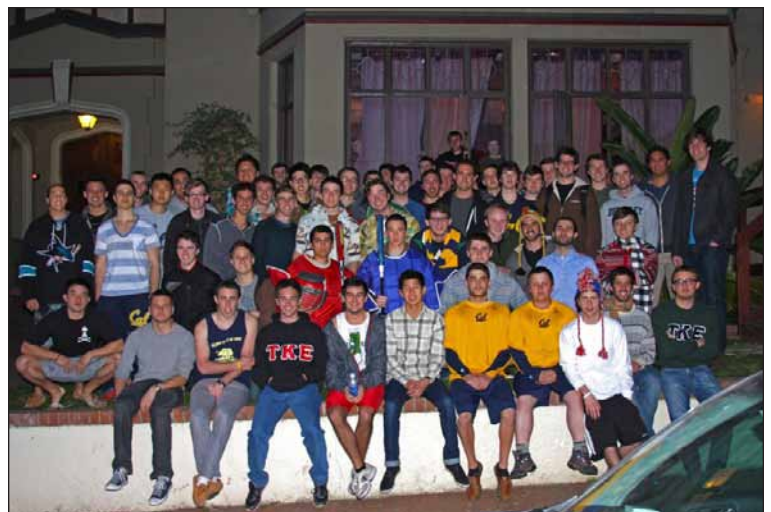
Fraters gather for an informal photo at the chapter house

This semester I have been blown away by the resilience and dedication of the Upsilon pledge class. They have taken every criticism and lesson I have presented to them, and have actively worked to implement them in their everyday life. I am looking forward to summer where I will have the opportunity to reflect on this past semester and my work so that I may refine the process and maximize the benefits of our process.