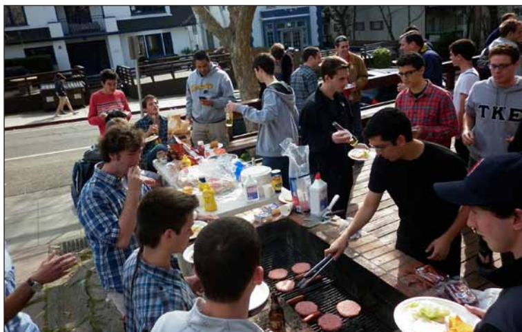
Fraters and alumni enjoy a front deck barbecue

I am a second year double-major in pure mathematics and ORMS (Operations Research and Management Science). I pledged in spring 2011. Although I did not hold any position in my first semester, after my term as Hypophetes I plan to become a chair for at least one semester and take on one or two little brothers before I graduate. The reason I joined TKE was because of the incredible brotherhood I experienced during rush and heard about before coming around the house. This is something I believe is wonderfully added to by our big brother program and constant flow of brotherhood activities hosted by the Hypophetes and brothers in the house. I believe it is of the utmost importance for a young man in his college years to have a strong group of friends that he can count on to support him and rely on in tough