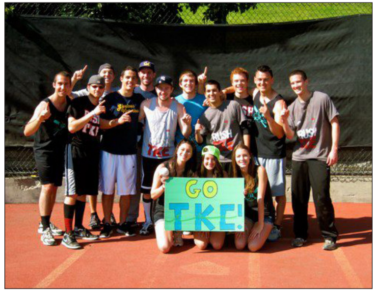
TKE wins Chi Omega's "Frats At Bat" for the second straight year

diligent work we can keep our GPA as one of the highest in IFC and continue to have the strongest brotherhood out there.