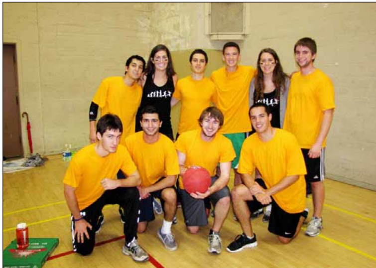
TKE Dodgeball Team gets ready for Kapa Alpha Theta's Annual Dodgeball Tournament