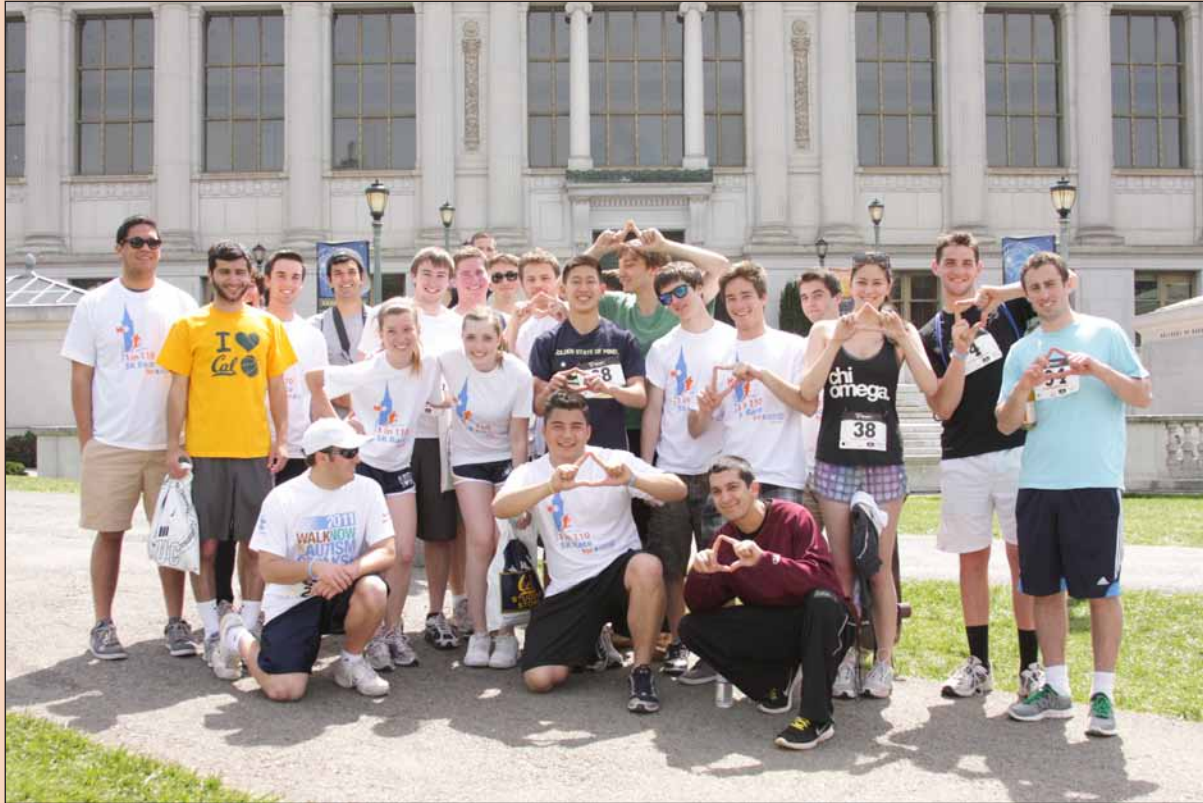
Fraters at “Autism Speaks”