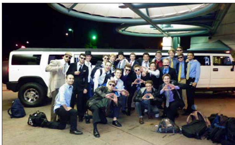
Nu Chapter at Annual Leadership Conference

In addition to remaining focused on our larger goals, I am also using my position as Prytanis to try and push accountability and efficiency for Nu Chapter. Little things such as being accountable for cleanups, and having more efficiently set up trash systems helps the cleanliness of the house, but also improves morale. Meetings also have become more efficient while still having a fun atmosphere.