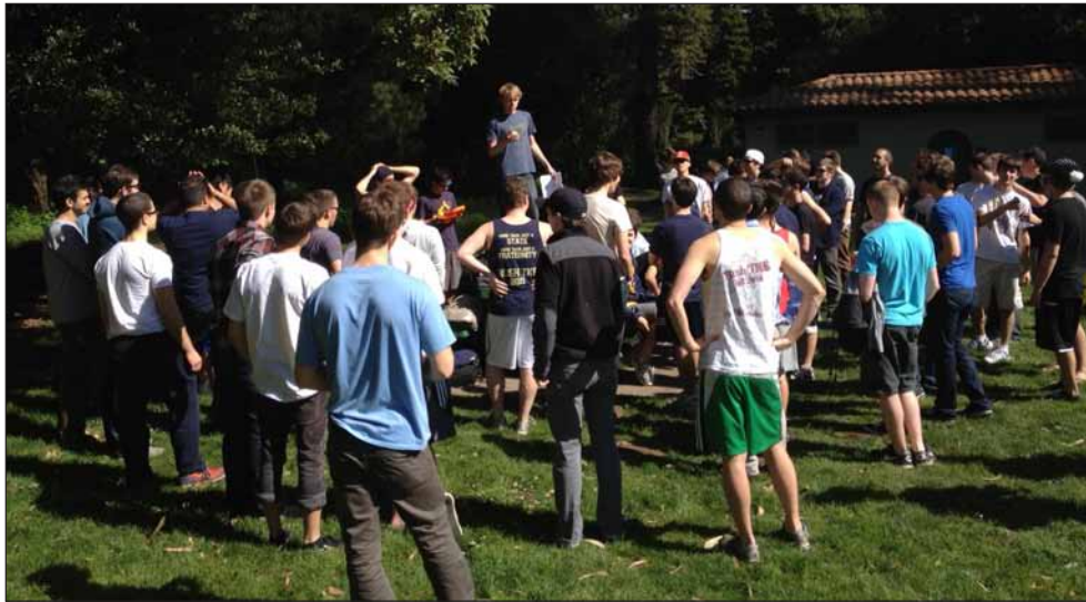
Fraters at Retreat in Golden Gate Park

relax; what I have found in the past is that by the afternoon, people become tired, and without diverse options of activities they begin to think again about their schoolwork and stop enjoying Retreat and worry about the obligations they face when they return. After a successful Retreat, I believe the house was recharged and ready to take on the rest of the semester. I look forward to organizing next semester's retreat, which I may try to change even more to continue to make it a unique and exciting day in the semester.