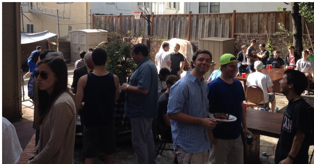
Prior to final farewells the chapter hosts a BBQ in the backyard