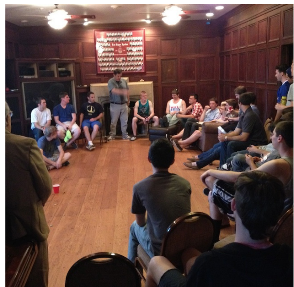
Chapter Alumni joined the graduating and undergraduate alumni during the final farewell.