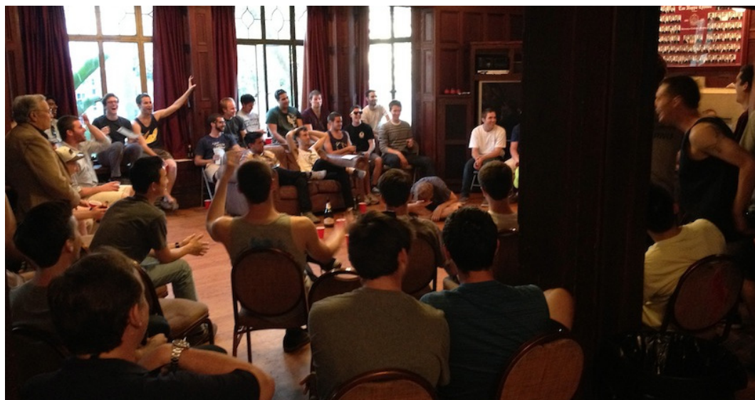
The chapter gathers in the living room to say goodbye to the graduating seniors